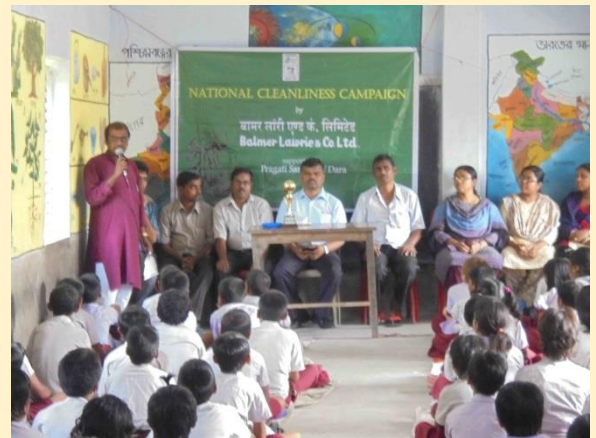
Quiz Program organised on Swachh Bharat in Chennai and in South 24 Parganas