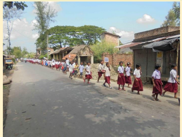
Rally in South 24 Parganas, Pathpukur School