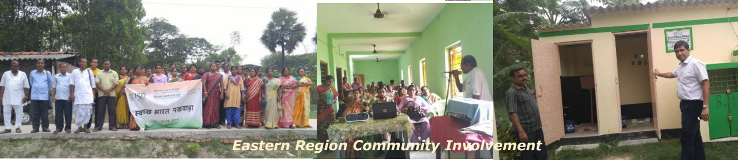
Eastern Region Community Involvement