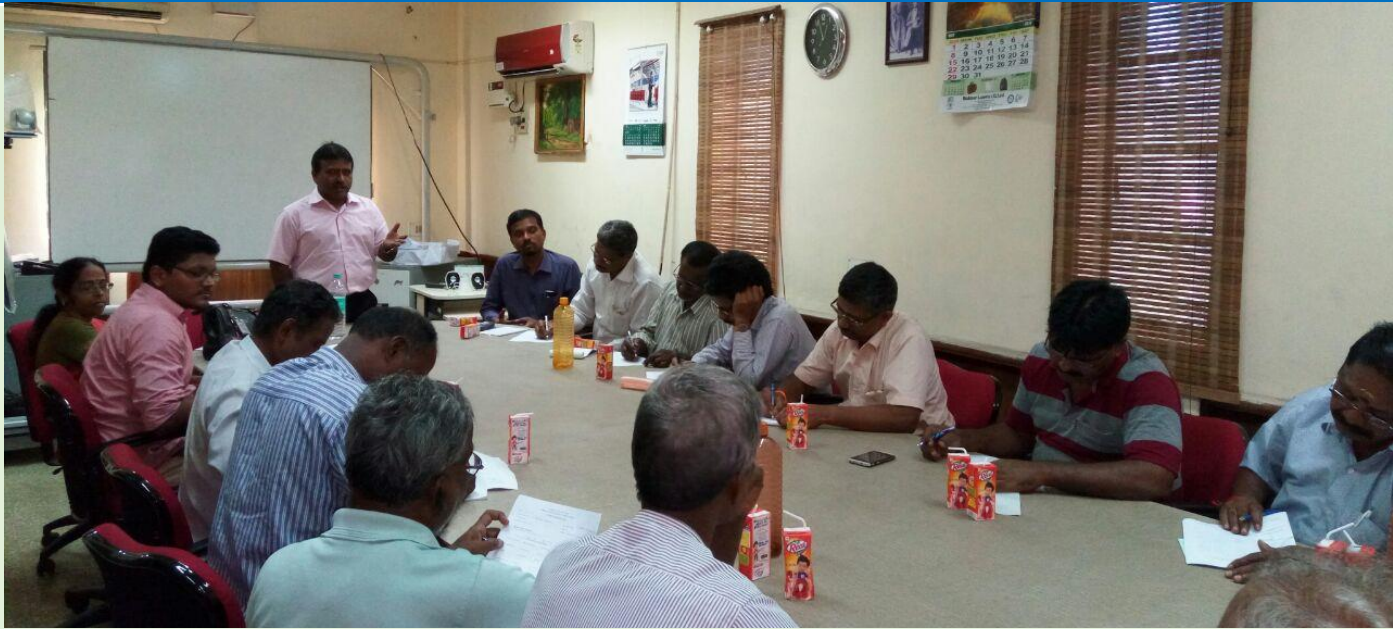
A training program on industrial safety was organized for non-officers in Chennai on 11 th May. The program was conducted by Deputy Director, Industrial Safety and Health, Chennai.