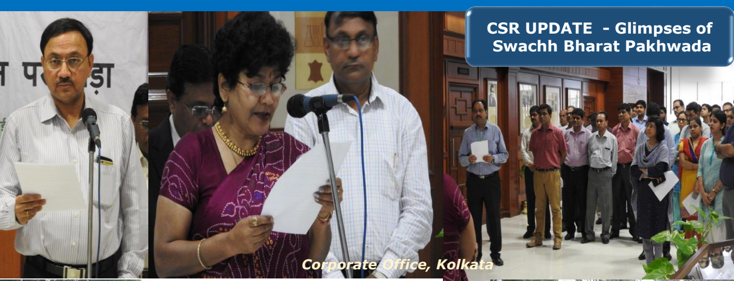
Corporate Office, Kolkata