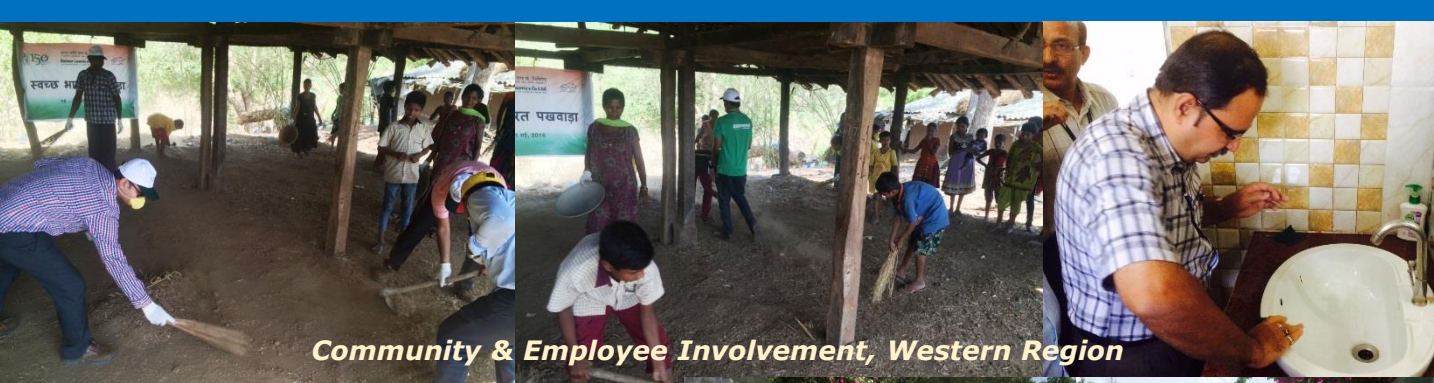
Community & Employee Involvement, Western Region