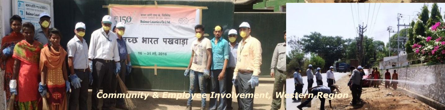
Community & Employee Involvement, Western Region

The Swachh Bharat Pakhwada was observed across all units / establishments from 16 th to 31 st May 2016. Various activities and awareness programs were organised during the fortnight for both employees and the communities in and around our work centres. In the eastern region awareness programs were conducted in Dara village, while in the western region the Balmerol Swachhta team visited Sayli Village and conducted an awareness program for the villagers on hygiene and importance of cleanliness. The team also cleaned a portion of the village along with the villagers and school children. Cleanliness drives were organised in other units as well. In photo are glimpses of the various activities undertaken pan India during the fortnight.