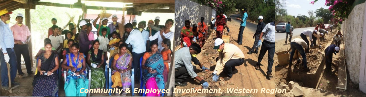
Community & Employee Involvement, Western Region