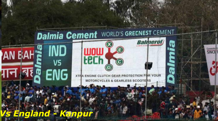
1 st T20 – India Vs England – Kanpur