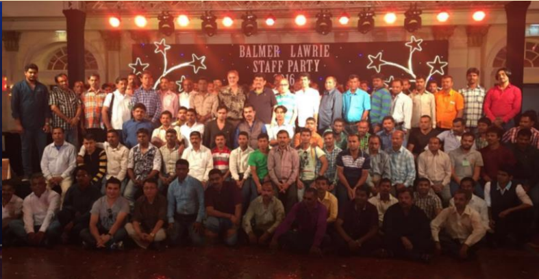
Employee Connect at BL UAE - Glimpses from the Staff Party organised annually to enhance employee bonding.