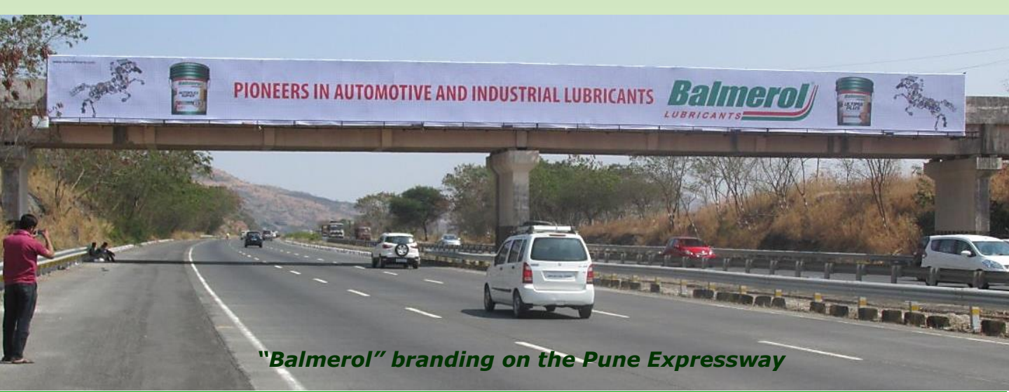
"Balmerol" branding on the Pune Expressway

Advertisement and promotion of the Balmerol brand in the three ODI and three T20 cricket matches - India vs England, received very good response. In photo are glimpses from the first T20 between India and England held at Kanpur and the third ODI between India and England held at Kolkata. The advertisement and promotion of brand Balmerol was done bilingually.