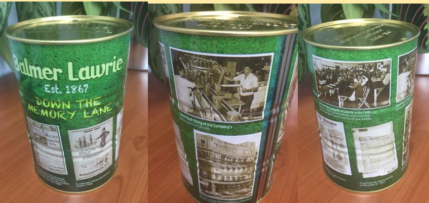
Innovative Steel Drum replica made by BL UAE Can Line Engineers.