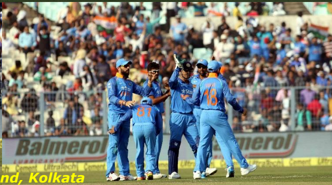
3 rd ODI – India Vs England, Kolkata

Advertisement and promotion of the Balmerol brand in the three ODI and three T20 cricket matches - India vs England, received very good response. In photo are glimpses from the first T20 between India and England held at Kanpur and the third ODI between India and England held at Kolkata. The advertisement and promotion of brand Balmerol was done bilingually.