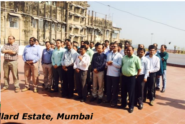
Ballard Estate, Mumbai