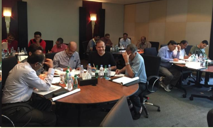
A Performance Management Workshop was recently organised at BL UAE.