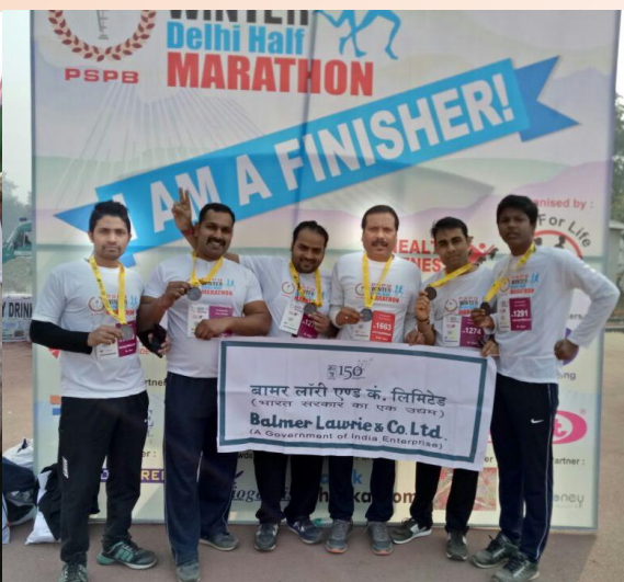
The PSPB Winter Half Marathon was organised in the memory of Netaji Subhash Chandra Bose as Desh Prem Diwas on 22 nd January, 2017 at the Jawahar Lal Nehru Stadium, New Delhi. The event was flagged off by Shri Dharmendra Pradhan, Hon'ble Minister of State [I/C], Ministry of Petroleum & Natural Gas, Government of India. Executives from our Delhi Office represented Balmer Lawrie at the event and they are seen in the enclosed pictures.