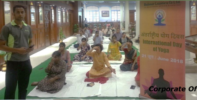
Corporate Office, Kolkata