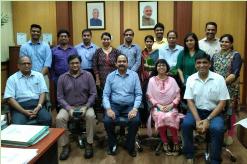
Congratulations to all the winners!