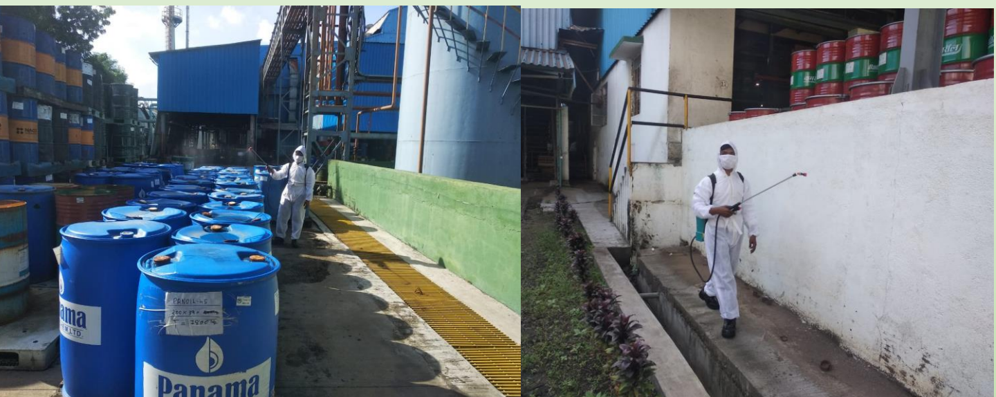
Sanitisation of the complete G&L plant at Silvassa was carried out on 26 th September 2020. All units and establishments of the Company are being sanitised periodically to contain the spread of COVID-19.