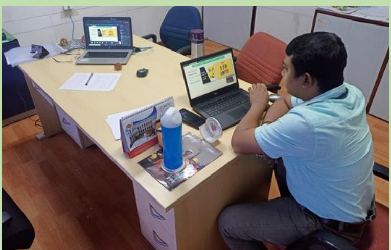
Online safety training for employees pan India was initiated by the HSE Department on 3 rd September, 2020. Four training sessions were conducted in the month of September.