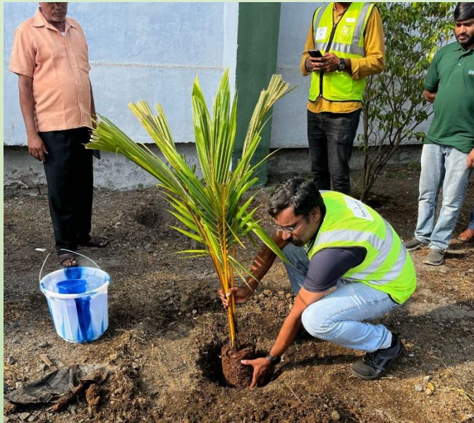
Container Freight Station (CFS) – Chennai organised a plantation drive on 20 th April 2024 in which twenty saplings were planted.