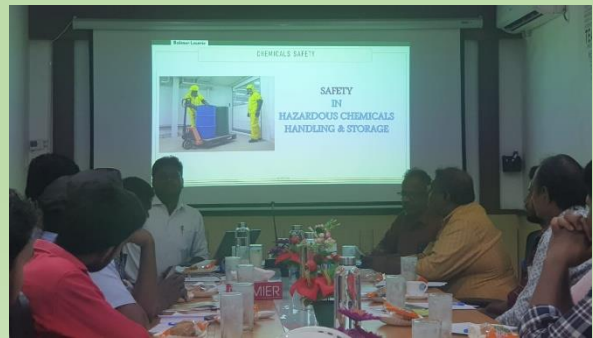
On 23 rd April 2024 a training on 'Safety in Hazardous Chemicals Handling & Storage' was organised at Manali Chennai.