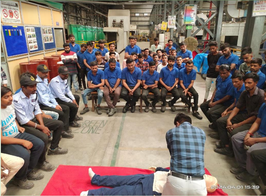
Basic life support training was conducted for all personnel in the Industrial Packaging plant at Vadodara 1 st April 2024.